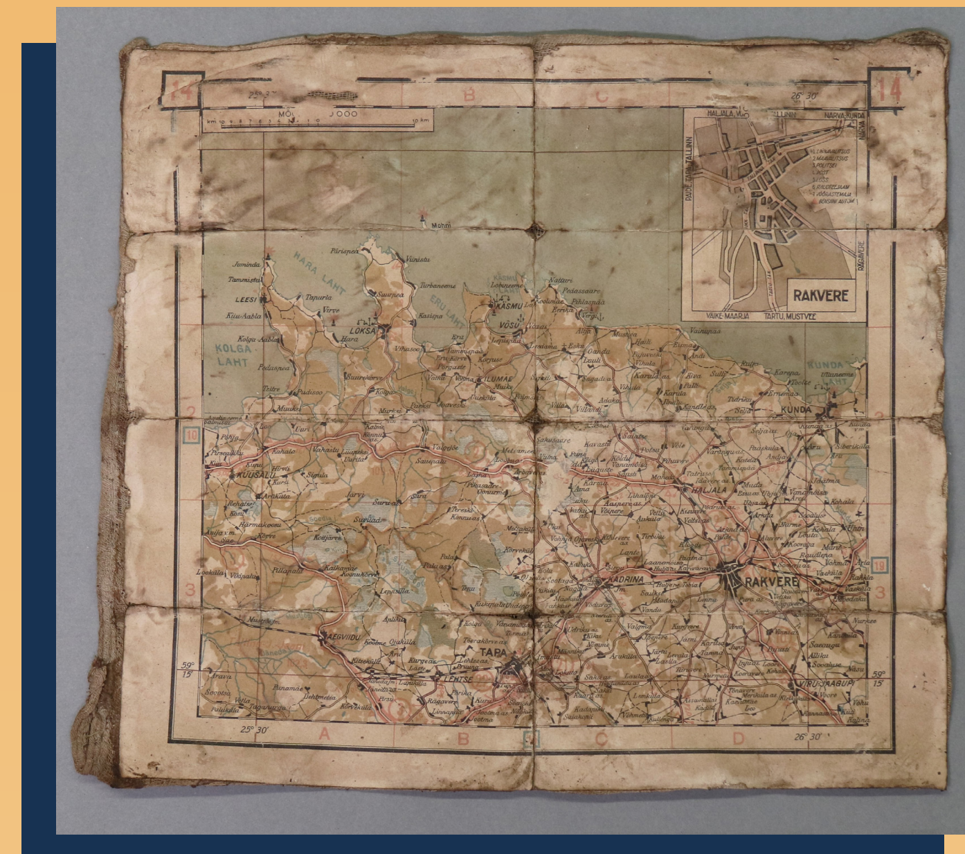
ill. 3 Map No.14 before the conservation