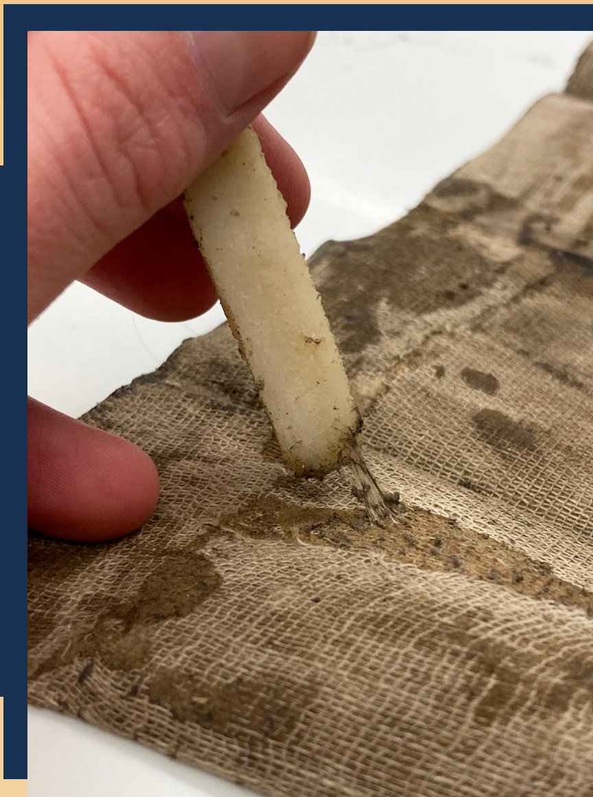
ill. 7 Removing glue with Crepe Eraser