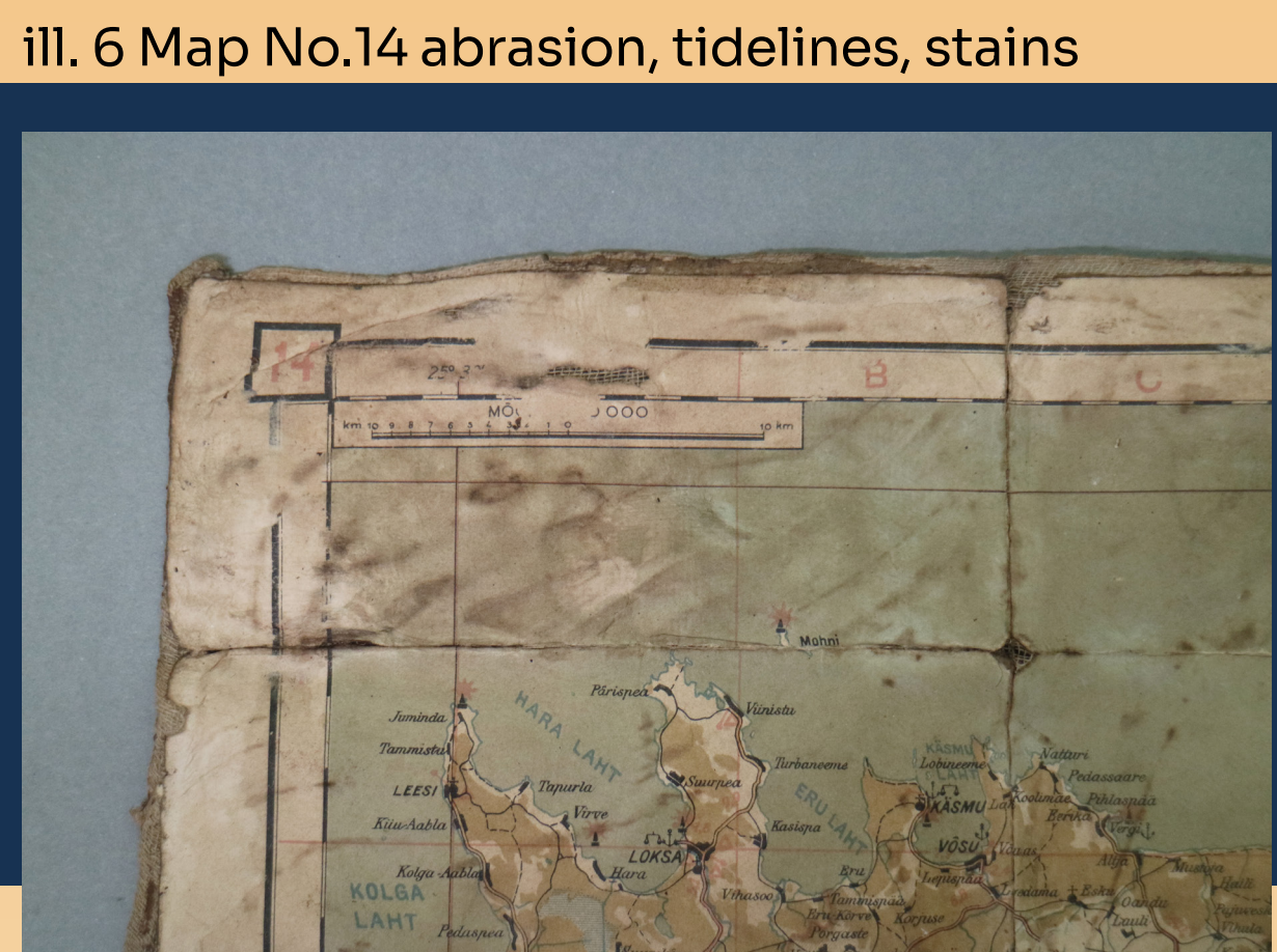
ill. 6 Map No.14 abrasion, tidelines, stains