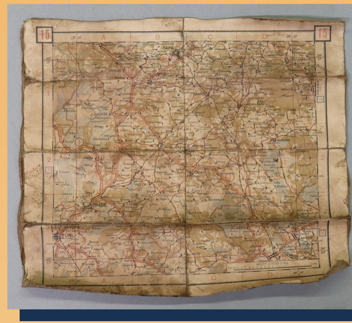
ill. 4 Map No.15 before the conservation