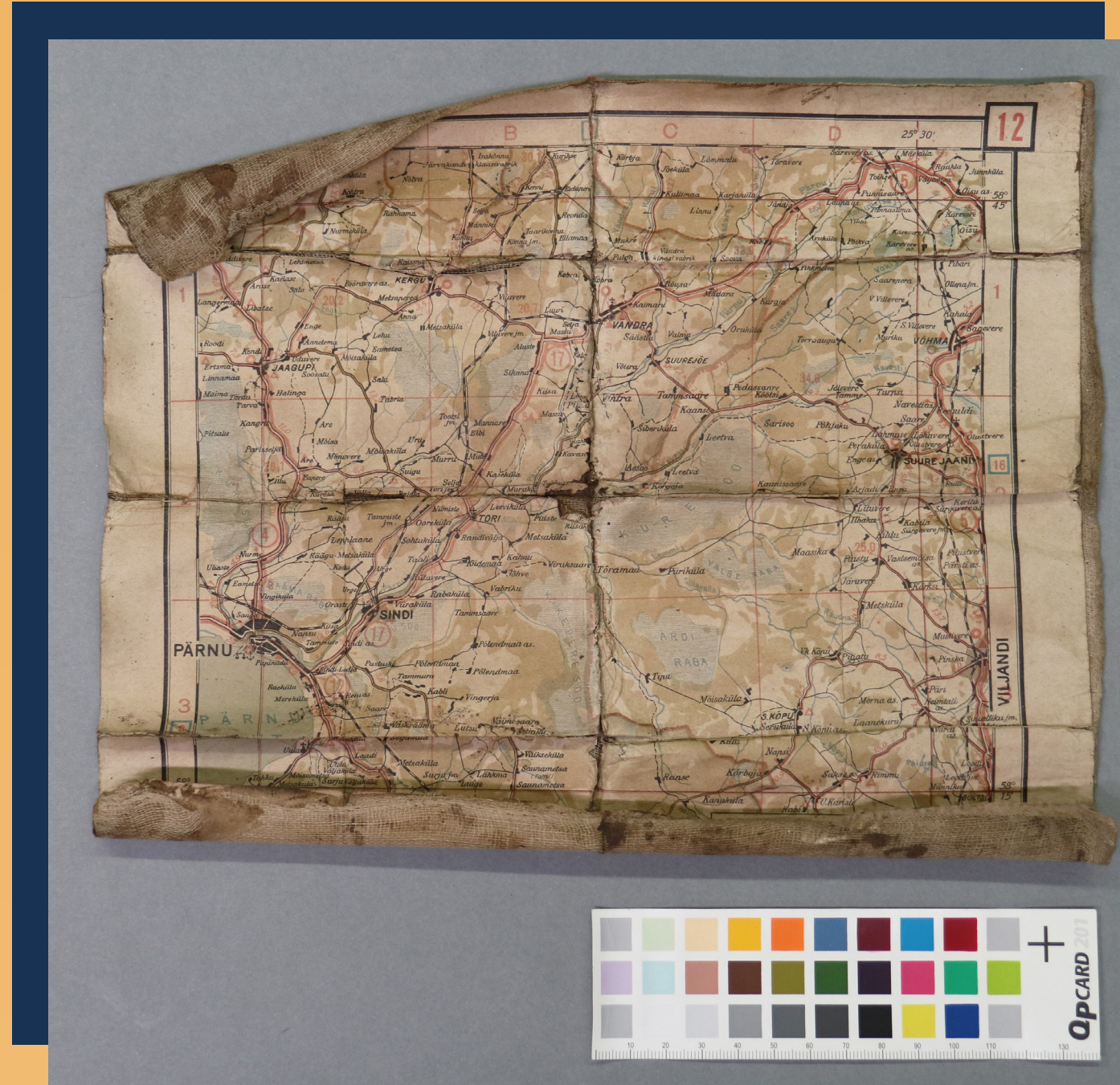
ill. 1 Map no.12 before the conservation

The unusually high pH value of the paper may have been caused by the storage environment (an aluminium milk container and other objects placed in it). The alkaline environment and humidity may have had a detrimental effect on maps.