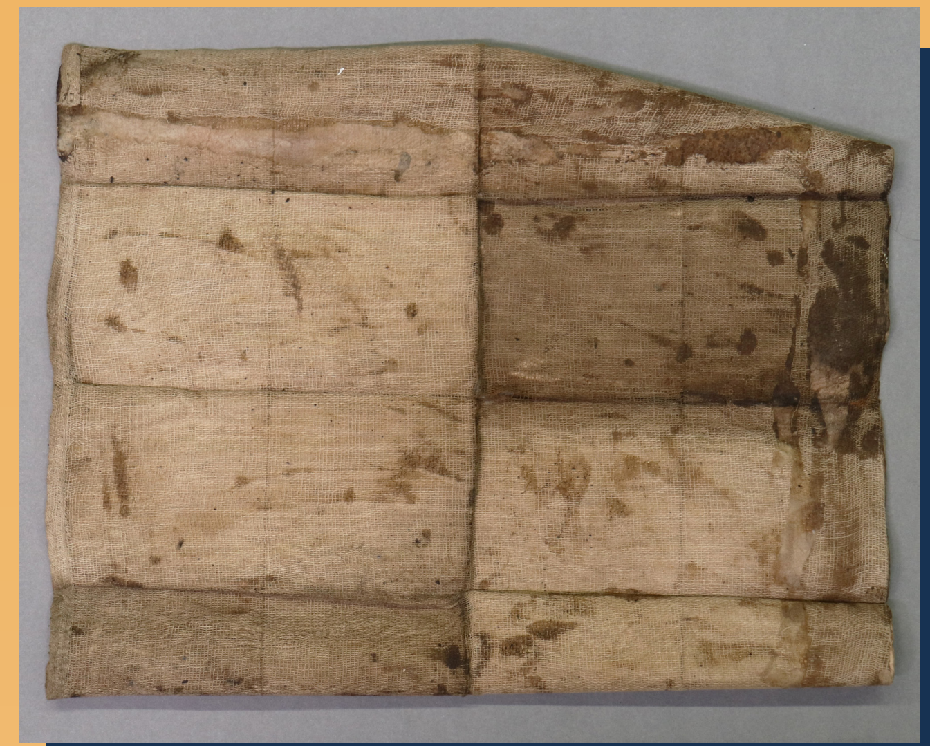
ill. 2 Map No.12 verso side before the conservation